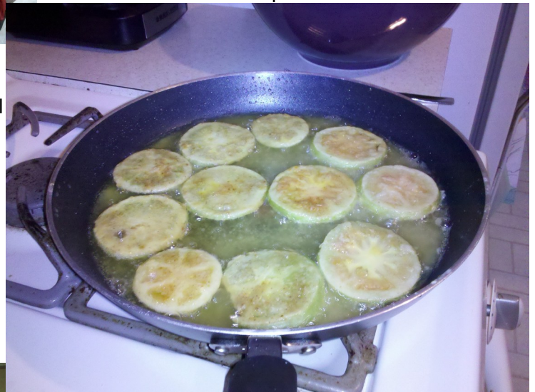
Above: We couldn't wait for them to turn red, so we picked a few tomatoes early and made fried green tomatoes. Yum!!

Aside from having fun with food, we took a trip over to the Point stadium and caught the Johnstown vs. Johnstown AAABA baseball game. Guess what? Johnstown won! Who knew? The weather couldn't have been more beautiful, and everyone enjoyed